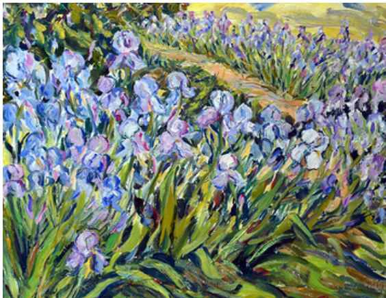
Irises & the Path Oil on Canvas - 30" x 36"